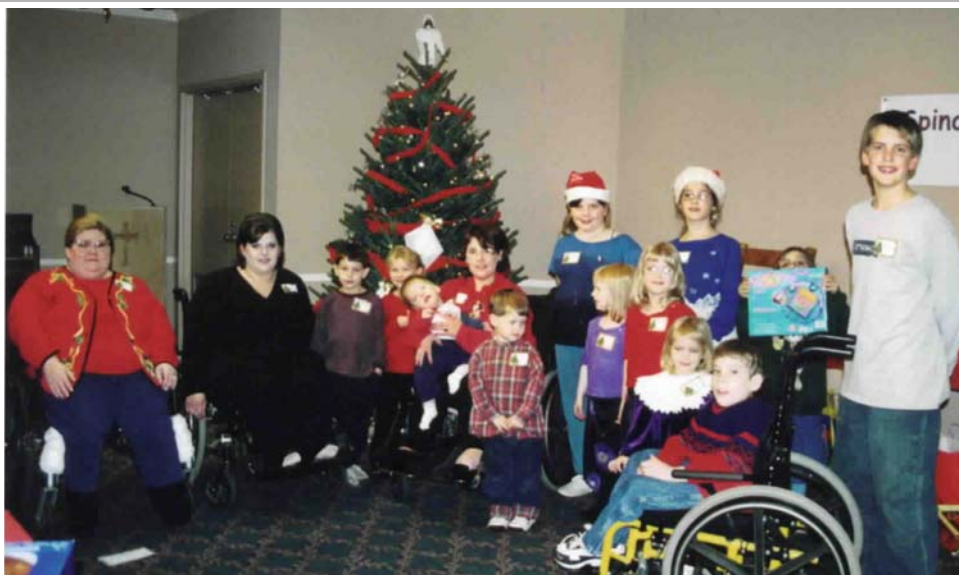
SBA of Miss. members of all ages gathered around the live tree for a picture. Our party has become a Christmas tradition for many families.